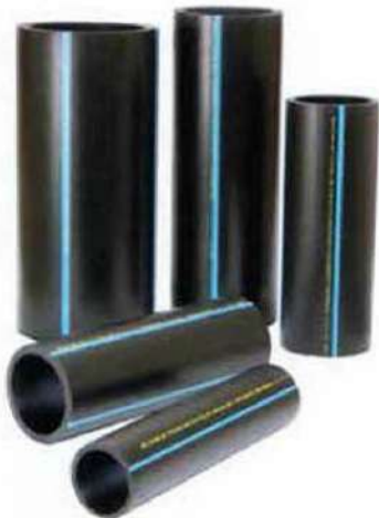
High Density Polyethylene (HDPE) pipe