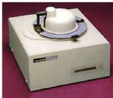
Oxidation Induction Time Tester