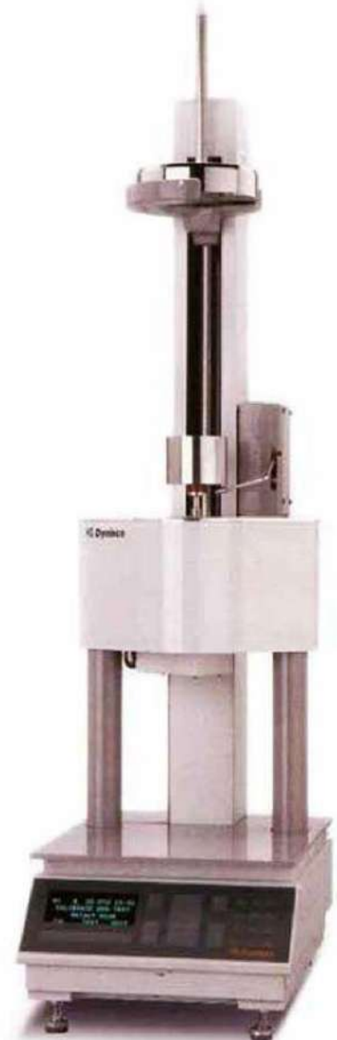
Melt Flow Rate Indexer