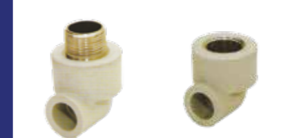
Threaded Male Elbow 90° Threaded Female Elbow 90°