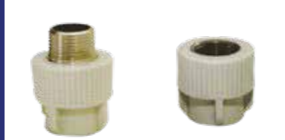
Threaded Male Coupling Threaded Female Coupling