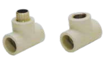
Threaded Male Tee Threaded Female Tee