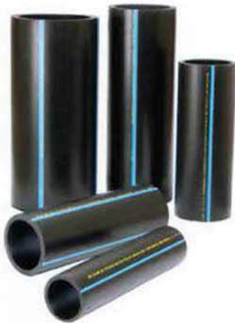
High Density Polyethylene (HDPE) pipe