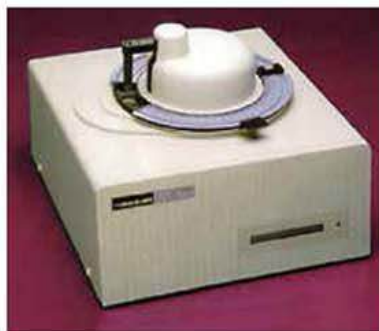
Oxidation Induction Time Tester