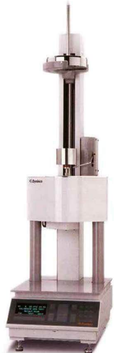
Melt Flow Rate Indexer